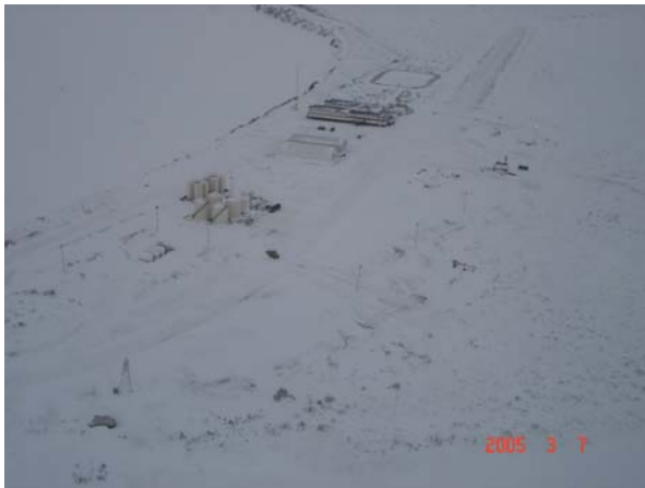
Figure 11. General. Swimming point (picture taken on March 3, 2005).