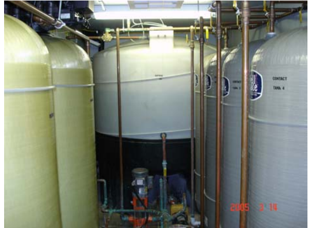
Figure 2. Water Supply. Fresh Water UV, flocculation, chlorination, de-chlorination, filtration system.