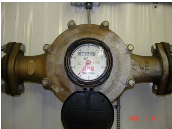
Figure 3. Water Supply. Water Intake Meter (1540.6 m 3 ).