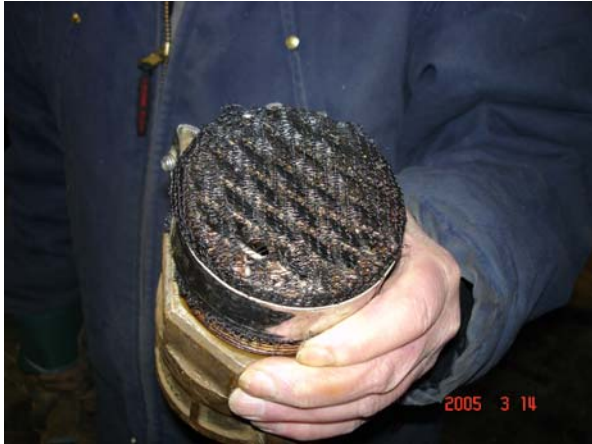
Figure 1. Water Supply. Fish screen used at Mackenzie River water uptake station.