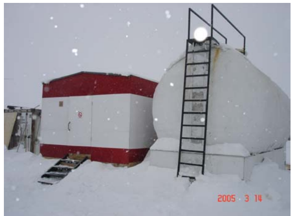
Figure 4. Waste Disposal. Sewage treatment building and storage tank.