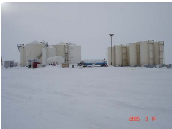
Figure 7. Fuel Storage. Fuel storage area.