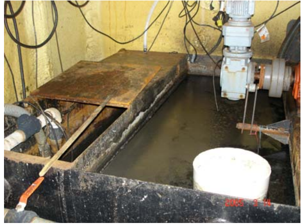
Figure 10. SNP. SNP sampling station 1793-1.