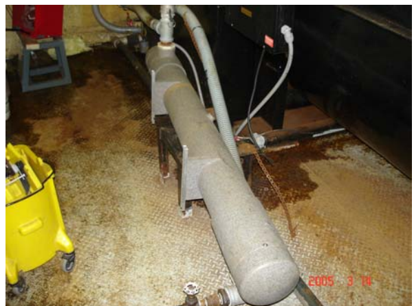
Figure 6. Waste Disposal. Sewage treatment RBC system UV tube.