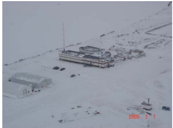
Figure 12. General. Swimming Point (picture taken March 3, 2005).