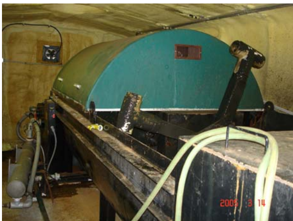
Figure 5. Waste Disposal. Sewage Treatment RBC system.