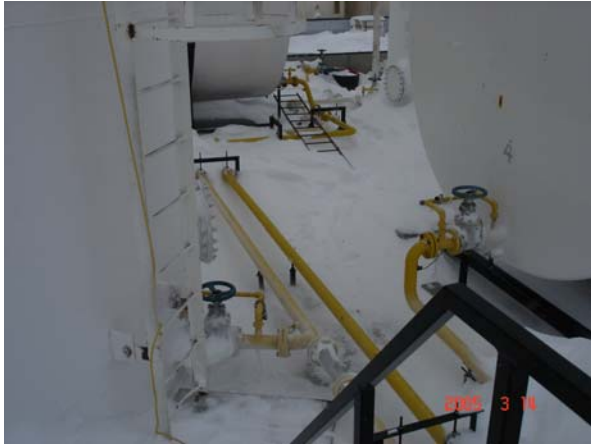
Figure 9. Fuel Storage. Fuel storage secondary containment.